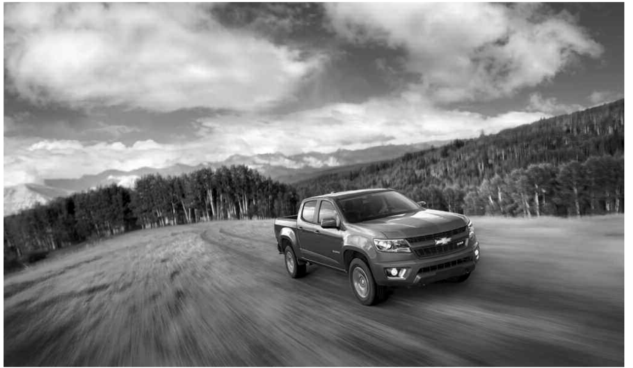
The all-new 2015 Chevrolet Colorado Z71 is built with the DNA of a true Chevy truck and is expected to deliver class-leading power, payload and trailering ratings. Colorado goes on sale in fall 2014.